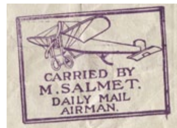
The violet cachet applied to the front of the folded 'Daily Mail' Aerogram