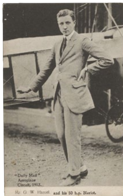
'Daily Mail' Aeroplane Circuit 1912, postcards showing the great pioneer aviator Gustav Hamel and his 50 h.p. Bleriot

The front of the postcard showing the aviator Bentfield Charles Hucks and in his machine