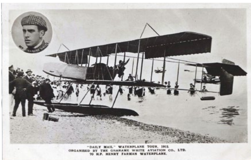
The ' Daily Mail ' Waterplane tour 1912, postcard depicting Claude Grahame-White

These pioneer flights in Great Britain during 1912 are a fascinating area of aero-philately. There is an opportunity for further original research into the flights, special postcards and cachets. Since I wrote the first draft of this article in mid-December 2011, I received further information and helpful comments from a member of the British Air Mail Society, of which I am proud to be a member. This is a good example of the importance and advantage of belonging to a specialist society.